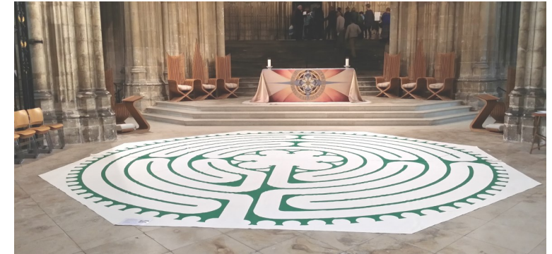
7 Circuit (8m)