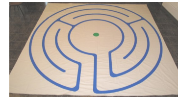
3 Circuit (3.7m)