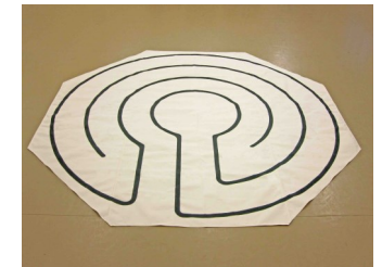
3 circuit (3.17m)